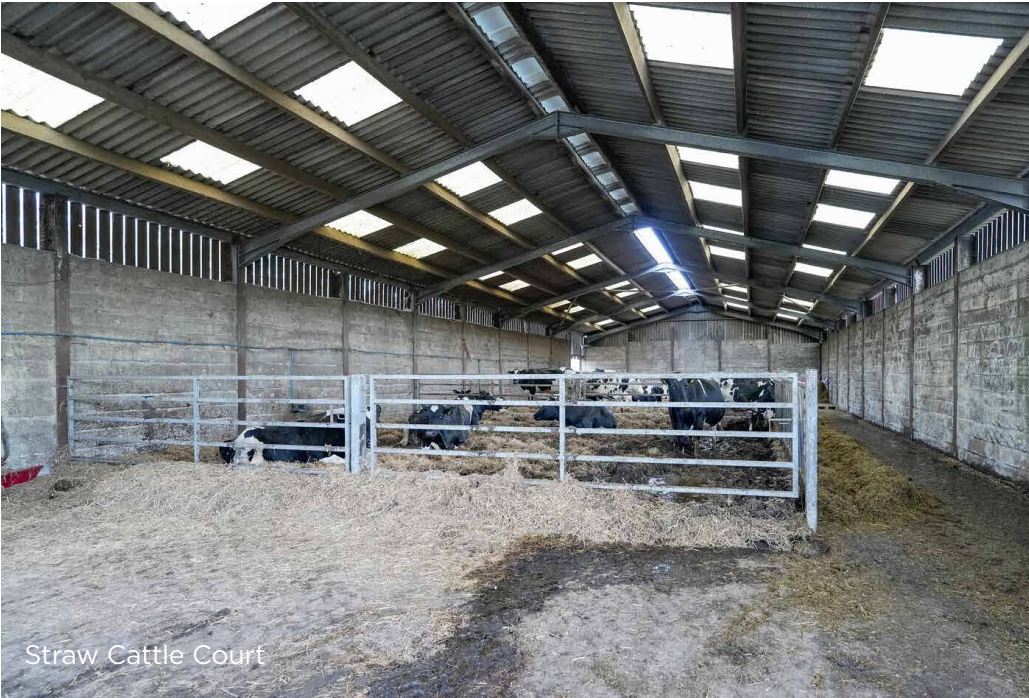
Straw Cattle Court