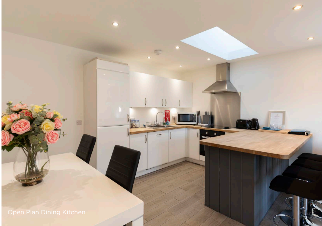
Open Plan Dining Kitchen