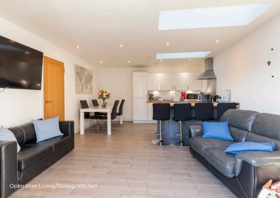
Open plan Living/Dining/Kitchen